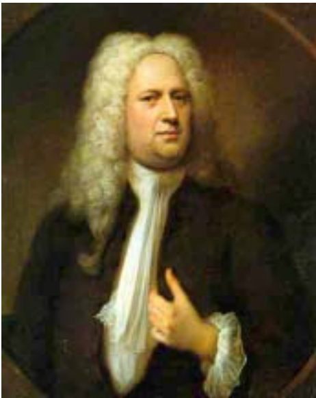
George Frederic Handel (1685–1759)

Dettingen Te Deum is music full of pomp and circumstance and was meant to be performed in a grand celebration. Many composers have set the Te Deum text, which comes to us from the Rule of St. Caesarius , A.D. 502. It is an ancient hymn of praise to God the Father, Christ the Redeemer, and the Holy Spirit. Throughout history it has been used as a thanksgiving hymn at consecrations, ordinations, days of celebrations, and military victories. Handel, who enjoyed many years of