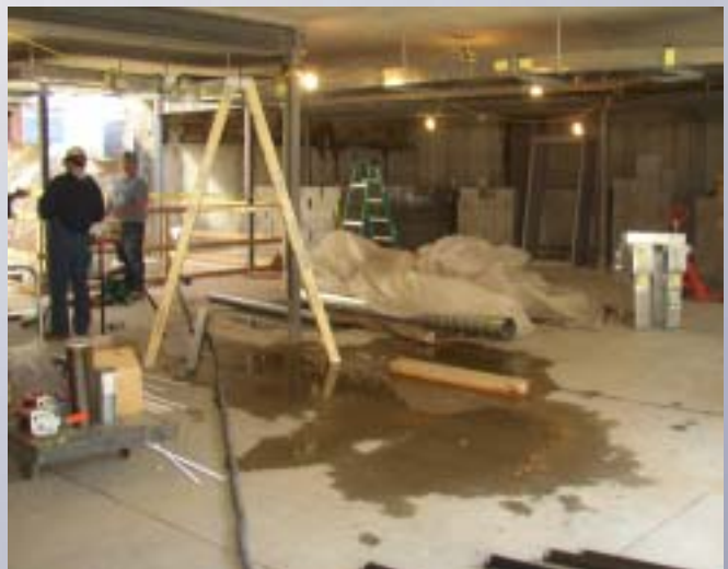
New Middle School and Senior High rooms