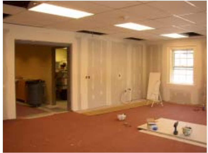
New second floor Knox Room