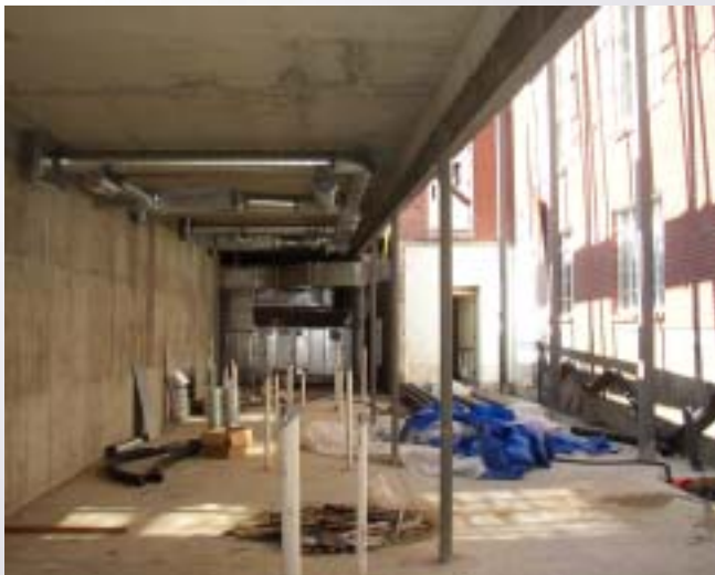
Atrium hall and new restrooms