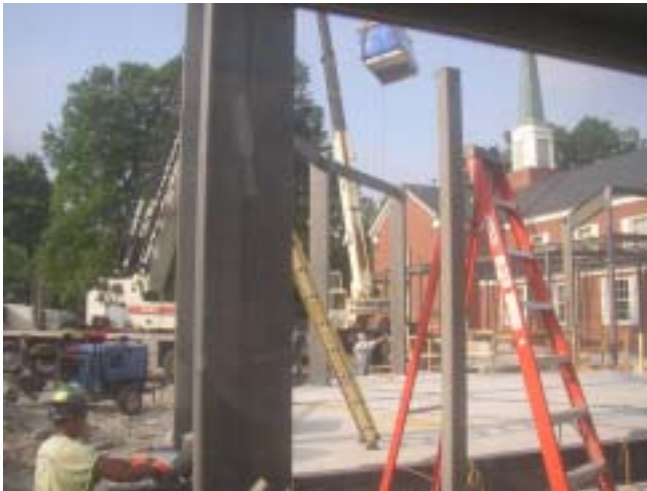
Structural steel going up