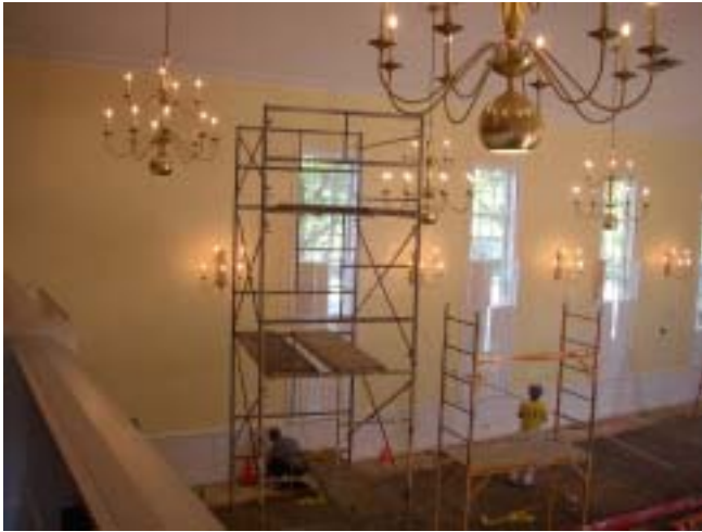
Painting in Sanctuary