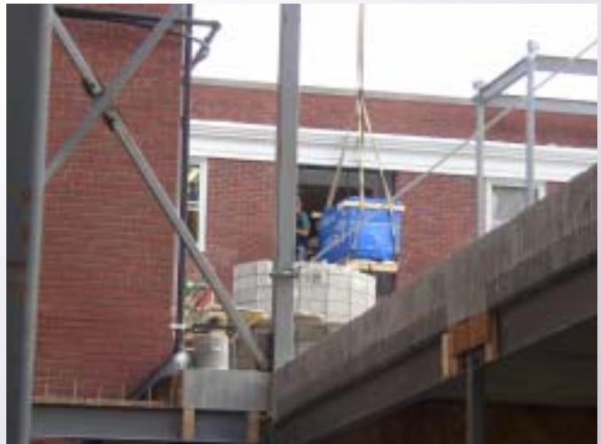
Air handlers lifted to second floor