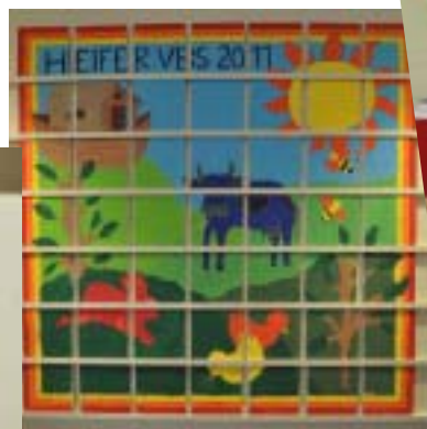
(cool craft projects!)