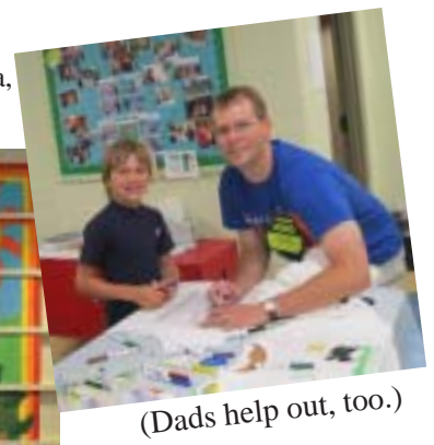
(Dads help out, too.)