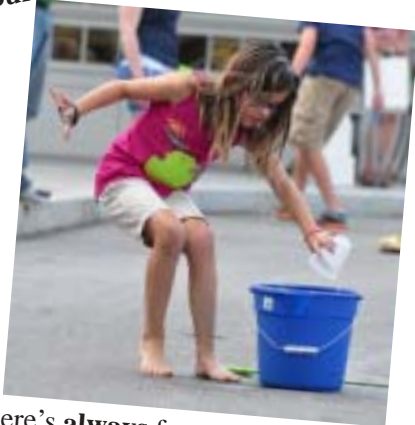
(There's always fun water activities!)