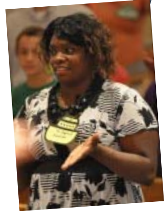
(Moms get involved!)