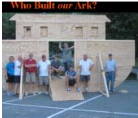
(We're famous for our ark!)