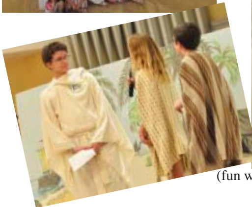
(fun with skits!)