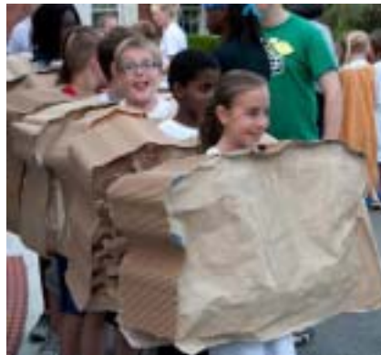
Participants prepare for the VBS 2010 Hand-Made Parade!

walk in a Parade, and that friends are the best! Thanks to the generosity of the NPC congregation, this annual FREE event continues to be a centerpiece of our Church School year.