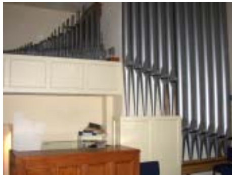
Photos taken in 2006, show Northminster's organ console & just some of the many pipes.