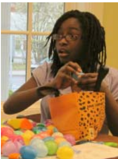
Fun for all ages!