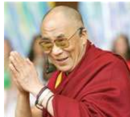
His Holiness, The Dalai Lama of Tibet