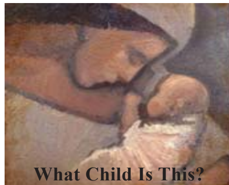
What Child Is This?

Fifty percent of the receipts to the Christmas Joy Offering are distributed to the Board of Pensions for assistance programs that provide support to retired and active church workers and their spouses and families. The other fifty percent supports Presbyterian-related racial ethnic education through the General Assembly Council. Plan for this very special offering on Christmas Eve.