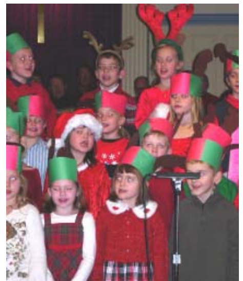
Children's choirs performing at Christmas Lite